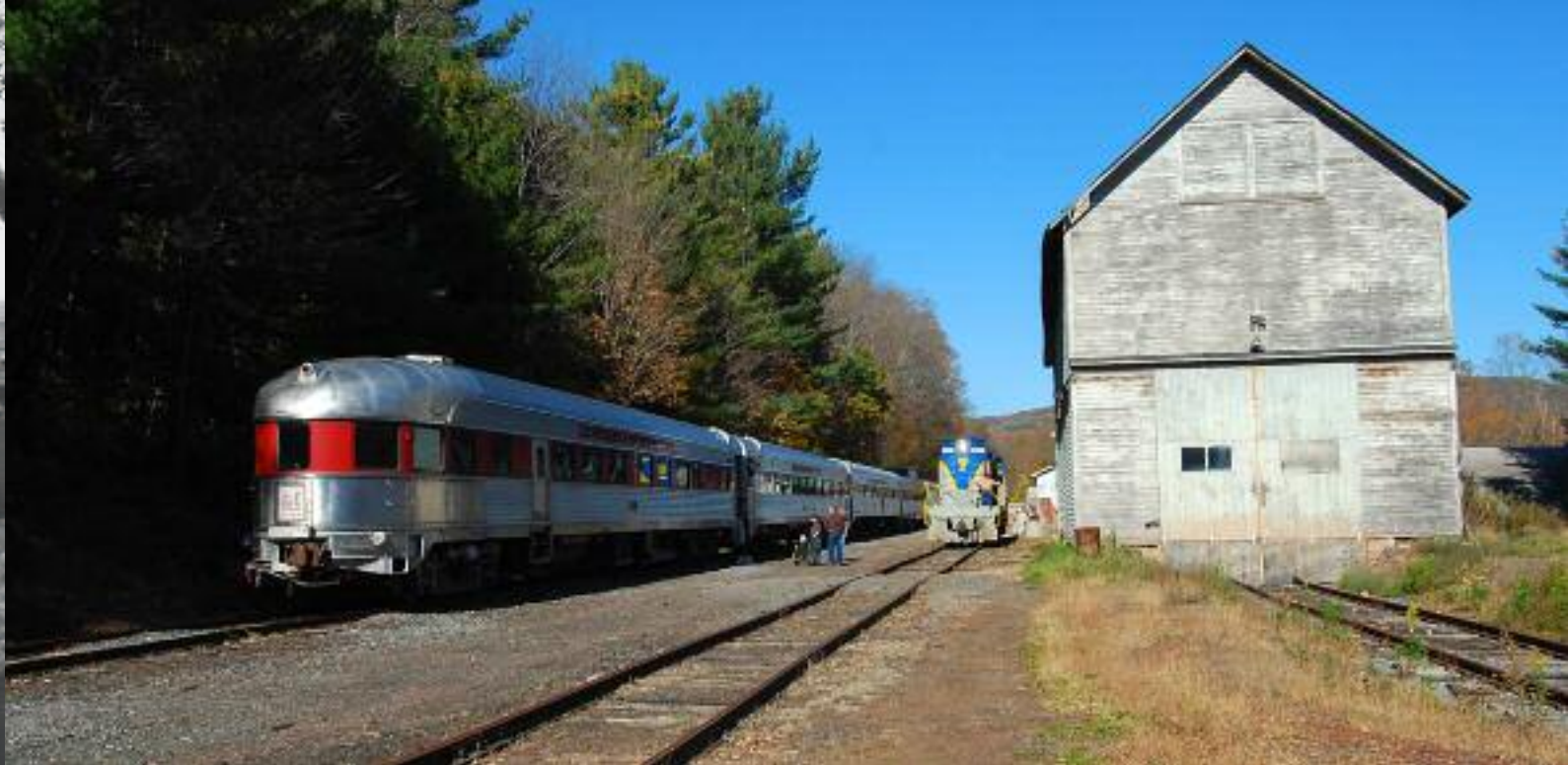
Delaware & Ulster RS36 No. 5017 runs around the Rip Van Winkle Flyer (with ex-NYC observation car No. 61) at Roxbury. An O&W business car lurks within the gray building on the right.

Boiceville Bridge, a $3 million fly in the restoration ointment for excursion trains, but no problem for a track car and trailer, then followed the north shore of the Ashokan. (The original right-of-way was somewhere under the reservoir's waters.) The track we rode was remarkably intact, considering its three-decade-long slumber, and easily navigable, thanks to stalwart brush-cutting efforts of the volunteers. At one point, a washout required us to walk while Healy eased his motor car over skeletonized track. As we walked, Pardini pointed out one of the relocation's original pitch-pine ties and original rails, without tie plates in some cases. He took out a knife and sliced off a sliver of tie. The pine resin was remarkably pungent after nearly a century in place. The entire scene, blazing with fall foliage, screamed "tourism potential."