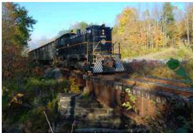
Delaware & Ulster S4 No. 5106 crosses the Batavia Kill near Kelly's Corners pulling the Catskill Mountain Branch local.

Almost immediately after leaving Cold Brook, we crossed the