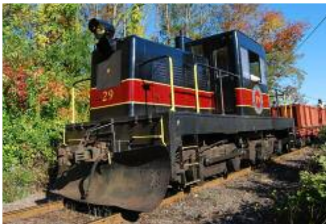
This 50-ton Porter powers Catskill Mountain trains between Mount Pleasant and Phoenicia on Oct. 12, 2008.