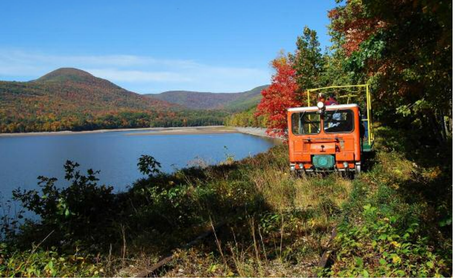
A Catskill Mountain track car and trailer ply a dormant stretch of the line along the Ashokan Reservoir on Oct. 12, 2008. The railroad hopes to offer excursions here in the future.